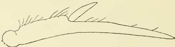
Serolis beddardi . Right uropod, from above.